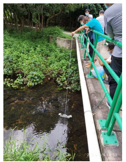
Water quality monitoring equipment at TCW-WQM6