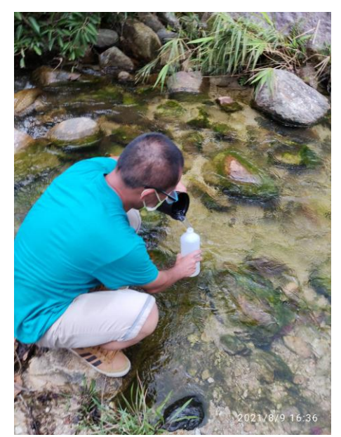
Water quality monitoring equipment at TCW-WQM5A