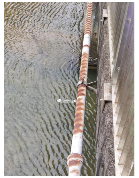
Water quality monitoring equipment at TCW-WQM1