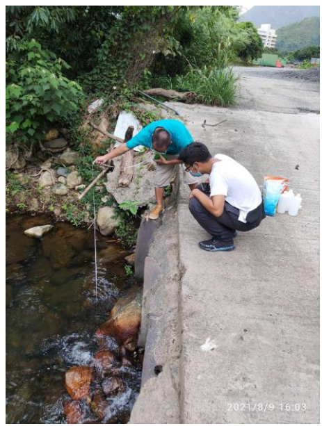
Water quality monitoring equipment at TCW-WQM2