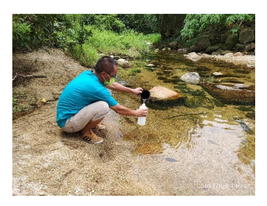
Water quality monitoring equipment at TCW-WQM7A