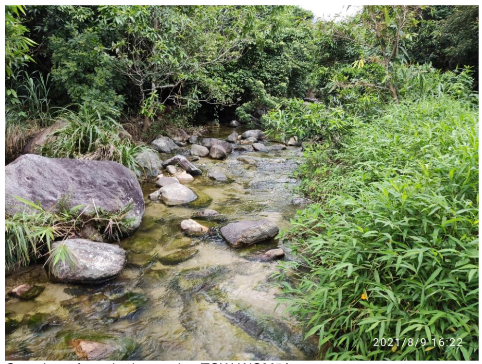
Overview of monitoring station TCW-WQM5A