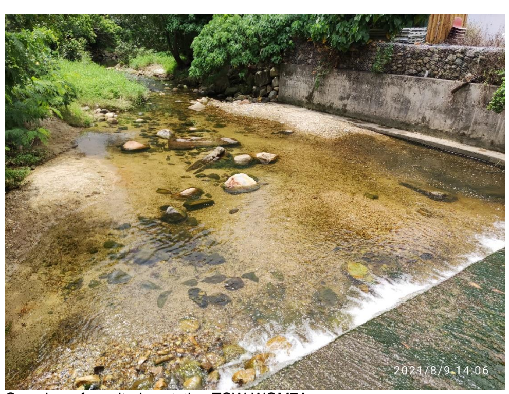
Overview of monitoring station TCW-WQM7A