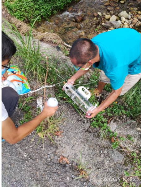
Water quality monitoring equipment at TCW-WQM3A