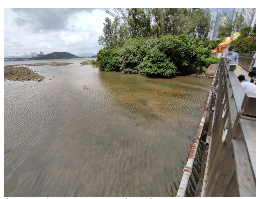
Overview of monitoring station TCW-WQM1