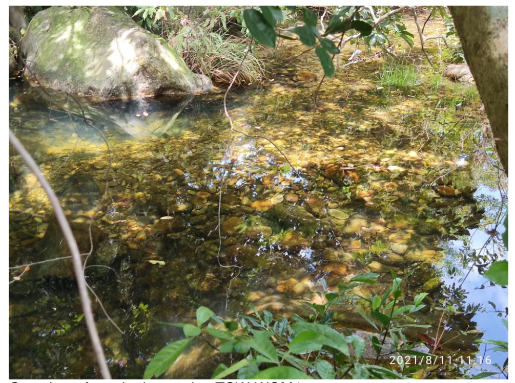
Overview of monitoring station TCW-WQM4