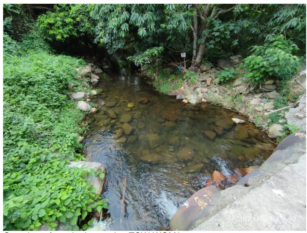
Overview of monitoring station TCW-WQM2