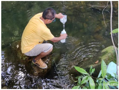
Water quality monitoring equipment at TCW-WQM4