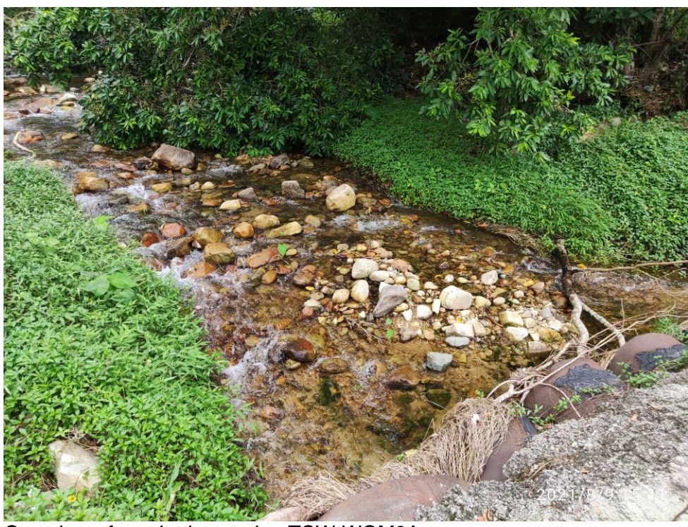
Overview of monitoring station TCW-WQM3A