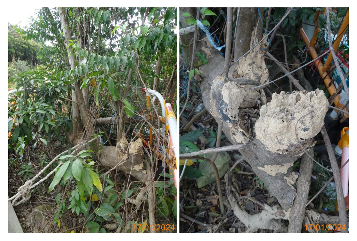
3: T8217_Termite track