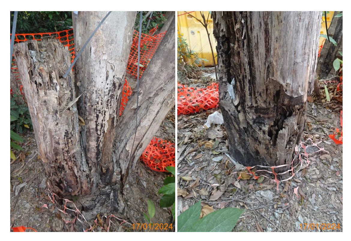
9: U041_Wood damage at trunk union