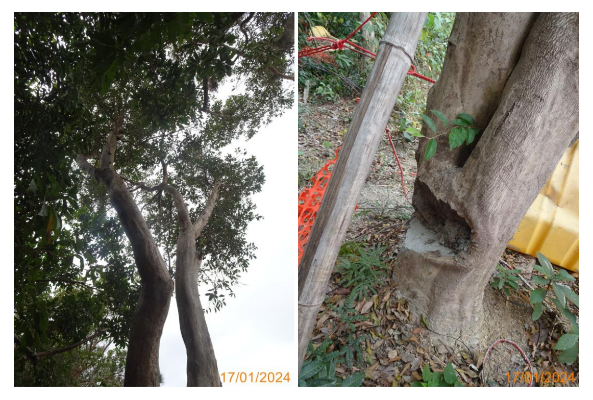
15: U043_Wound on trunk#1