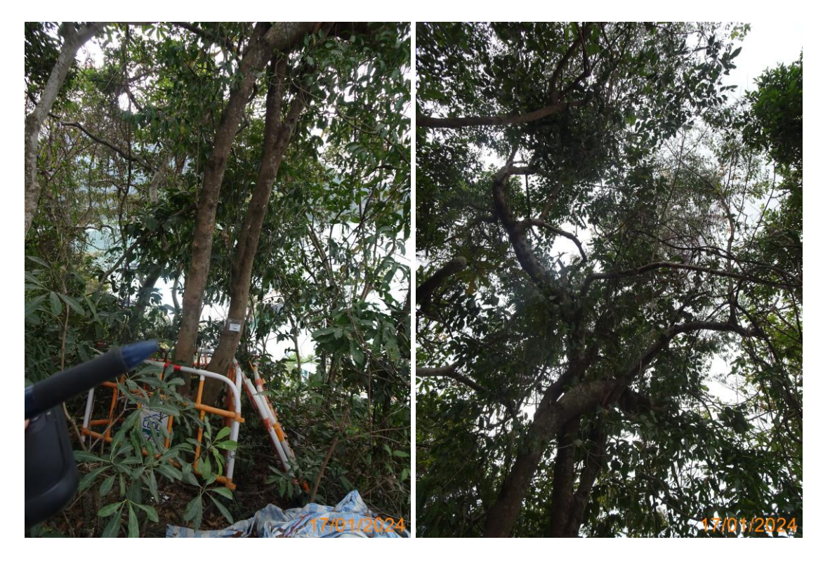
1: T8217 2: T8217_Crown