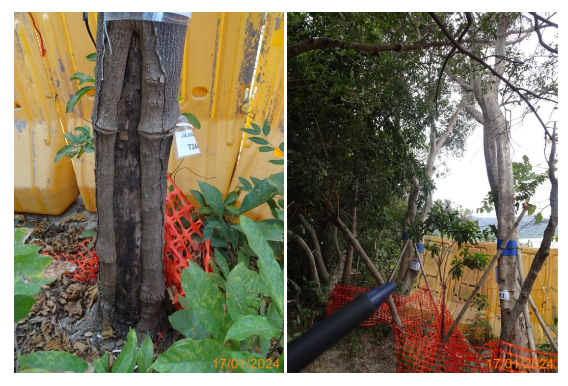
13: U042_Wound on trunk