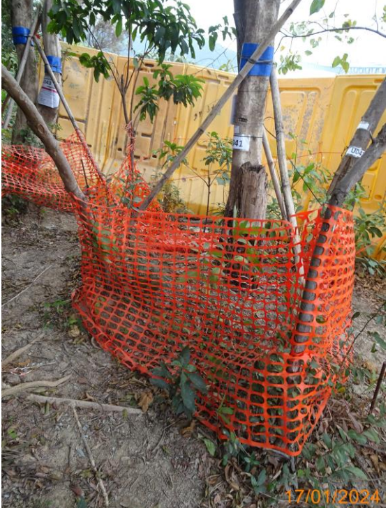
20: Temporary protective fencing for U041, U042 and U043e \,