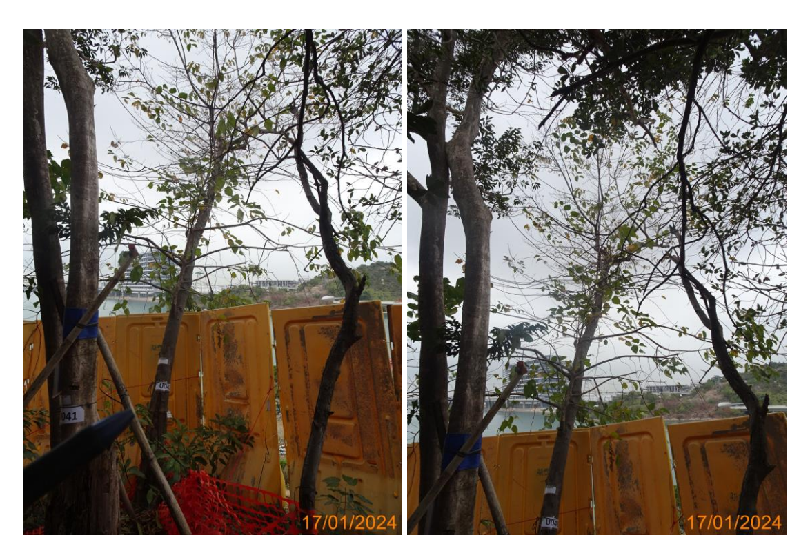
11: U042 12: U042_Crown