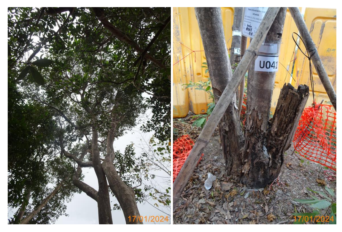
7: U041_Crown 8: U041_Dead stump