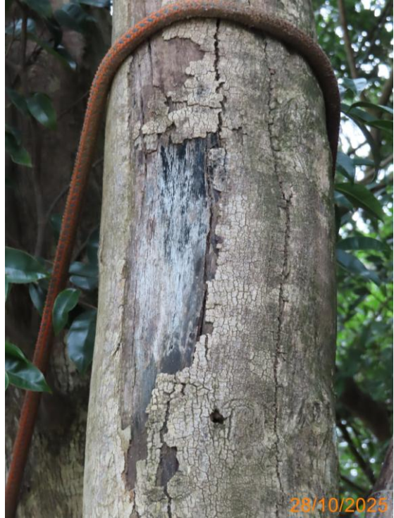
10: U041_Abnormal bark crack on trunk_Close up