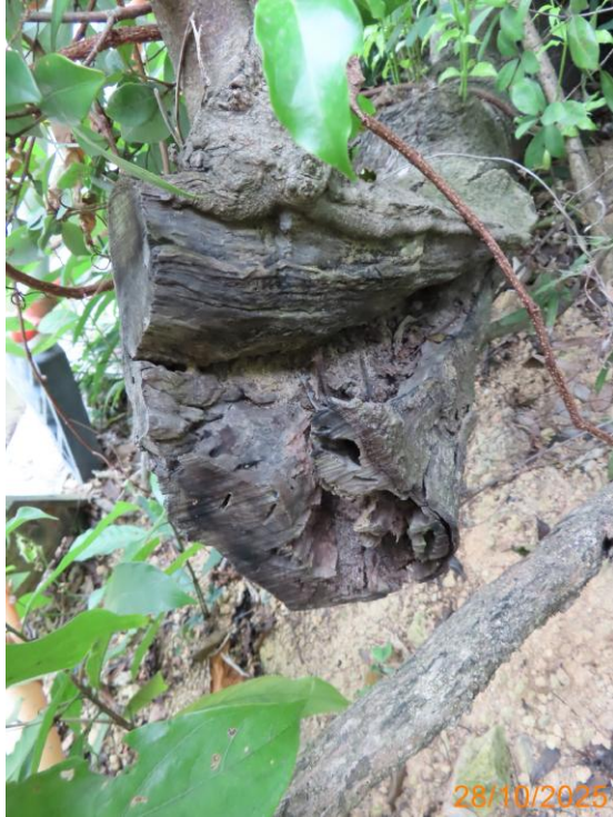
5: T8231_Borer hole#1