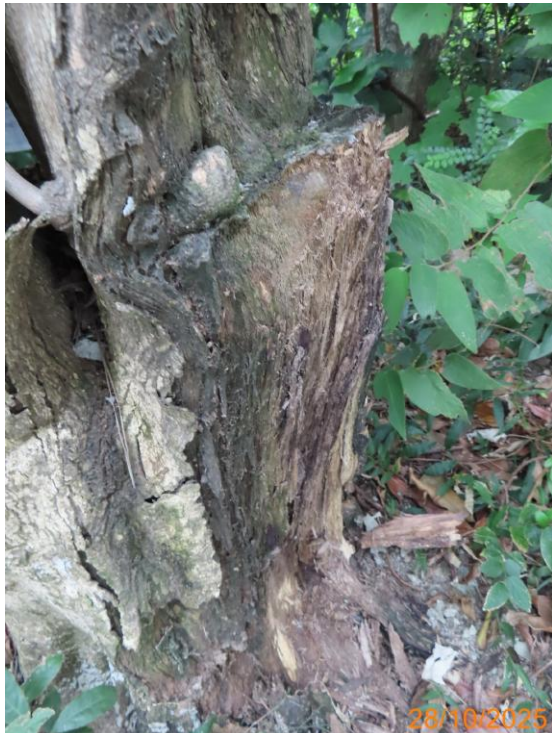
19: U043_Crack on trunk