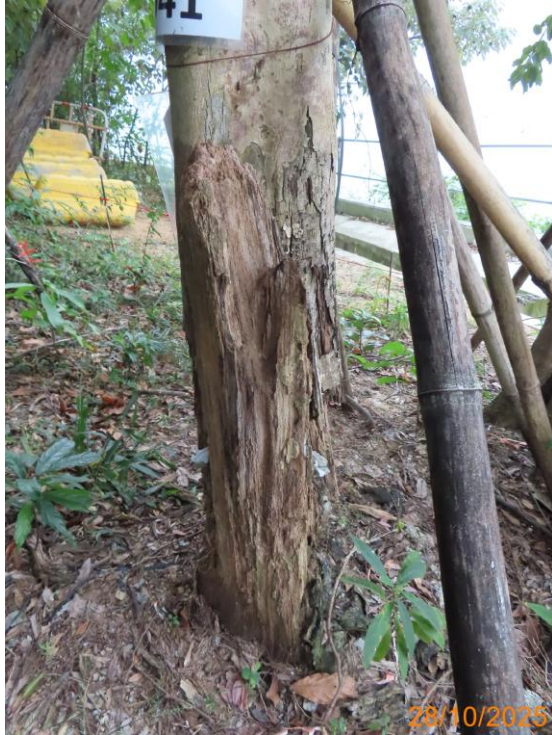
13: U041_Wood damage at trunk union#1