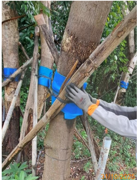
24: Adjust protection pad for U042