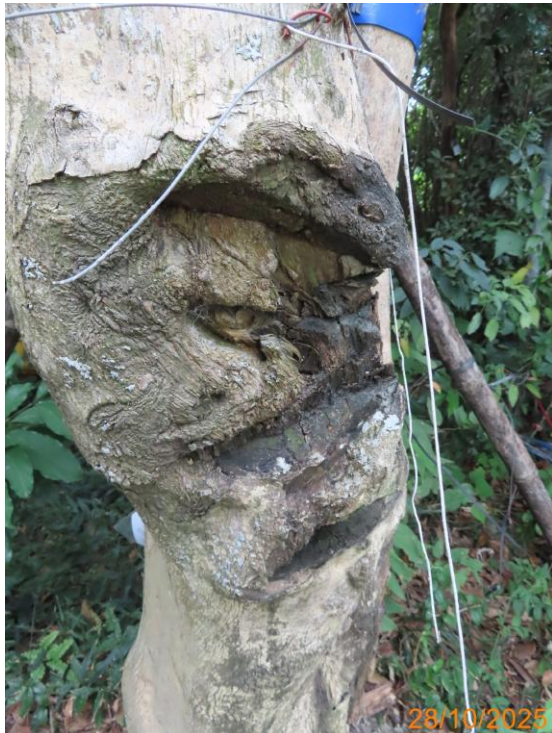
23: U043_Wound on trunk#3