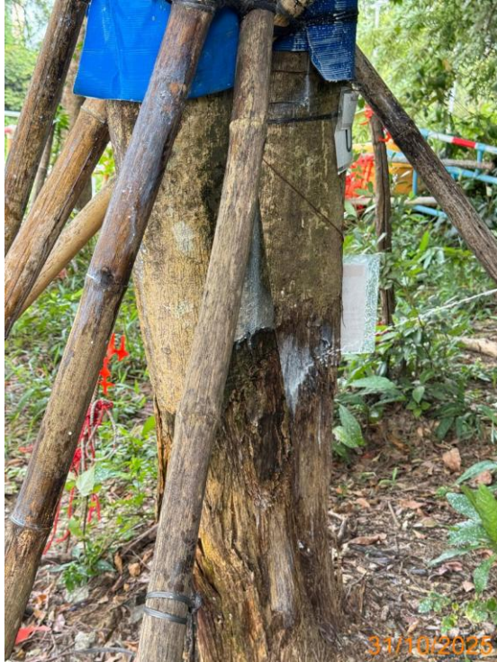
25: Application of pesticide for U041