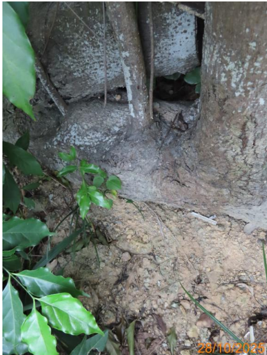
7: T8231_Trunk base