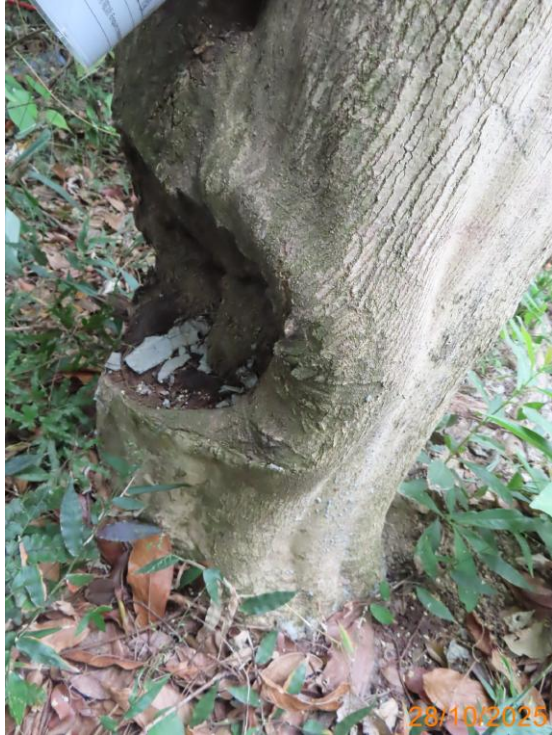
21: U043_Wound on trunk#1