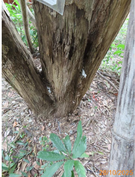
14: U041_Wood damage at trunk union#2