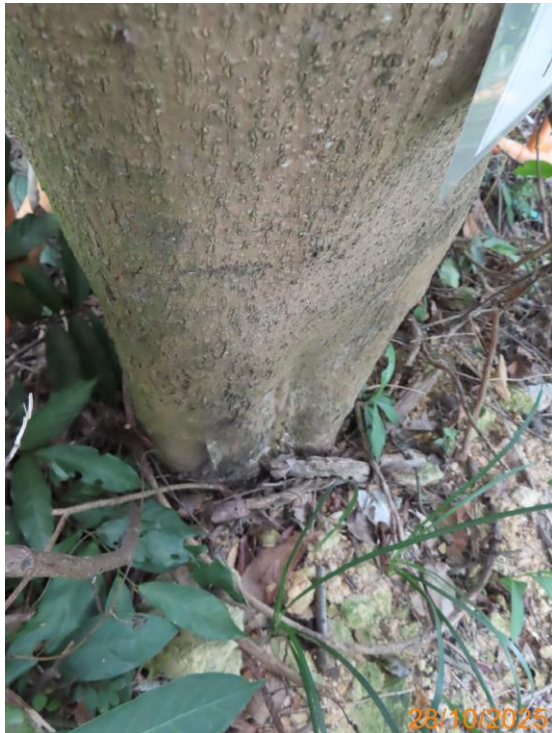
3: T8217_Trunk base