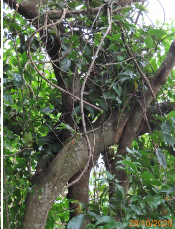
2: T8217_Cross branches