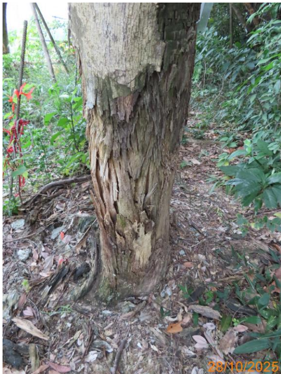
11: U041_Crack on trunk