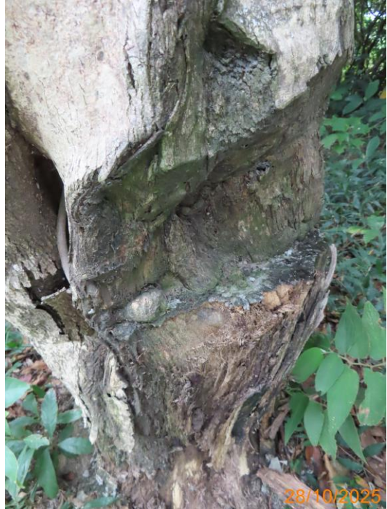
22: U043_Wound on trunk#2