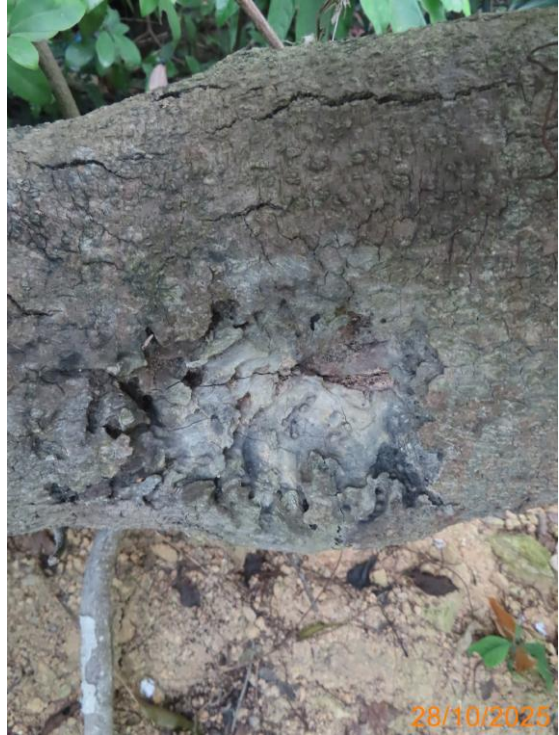
6: T8231_Borer hole#2