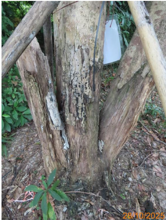
15: U041_Wood damage at trunk union#3