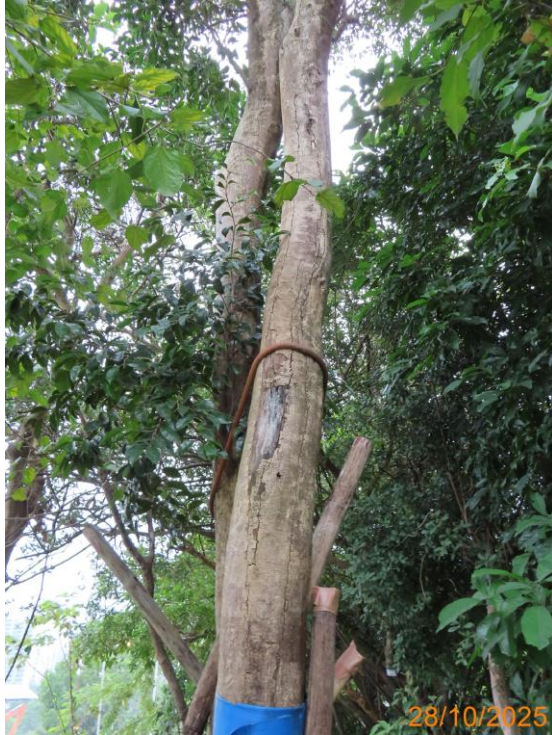
9: U041_Abnormal bark crack on trunk