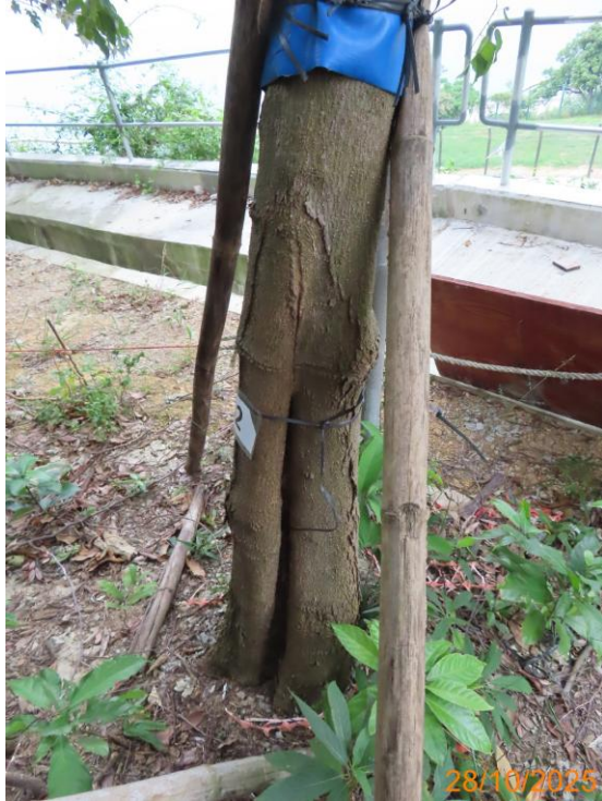
17: U042_Wound on trunk base