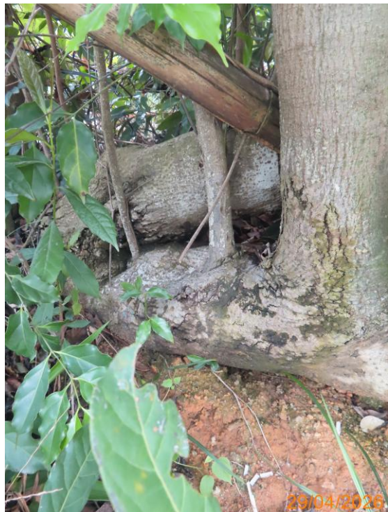
8: T8231_Trunk base