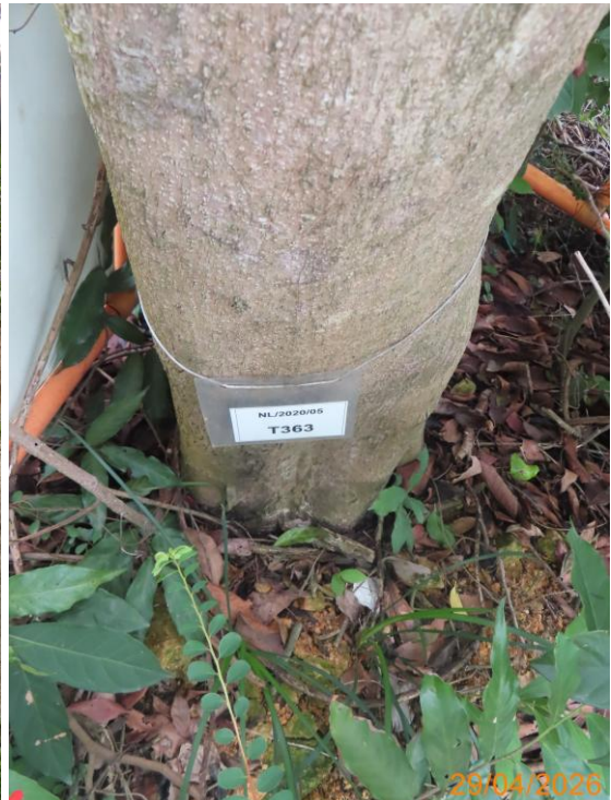
4: T8217_Trunk base