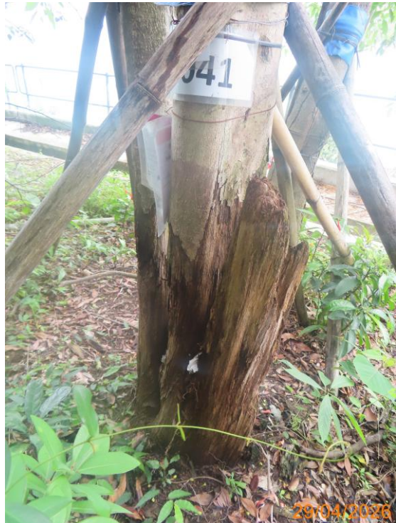
16: U041_Wood damage at trunk union#2