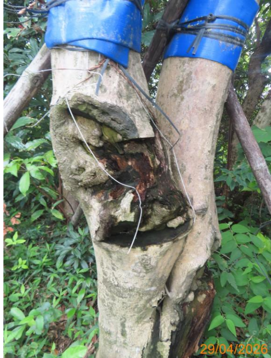
22: U043_Wound on trunk#1