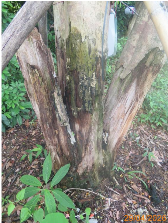
15: U041_Wood damage at trunk union#1