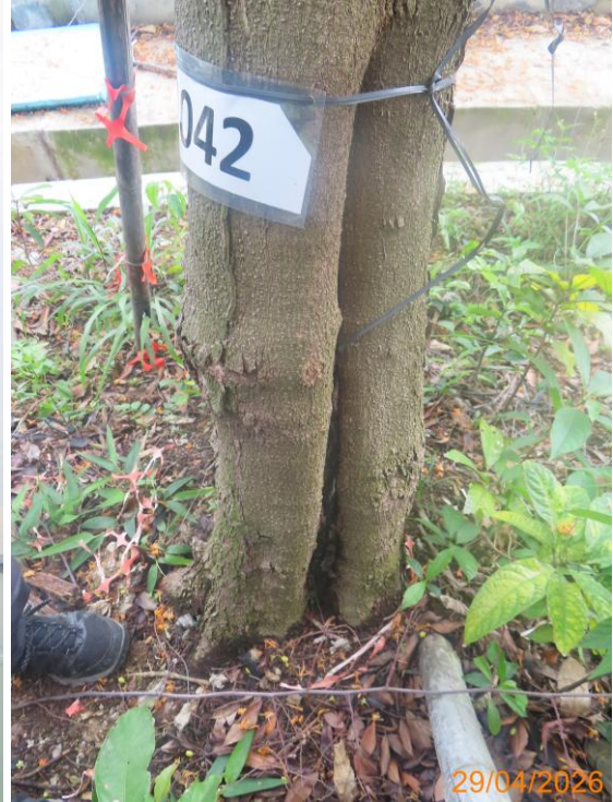
18: U042_Wound on trunk base