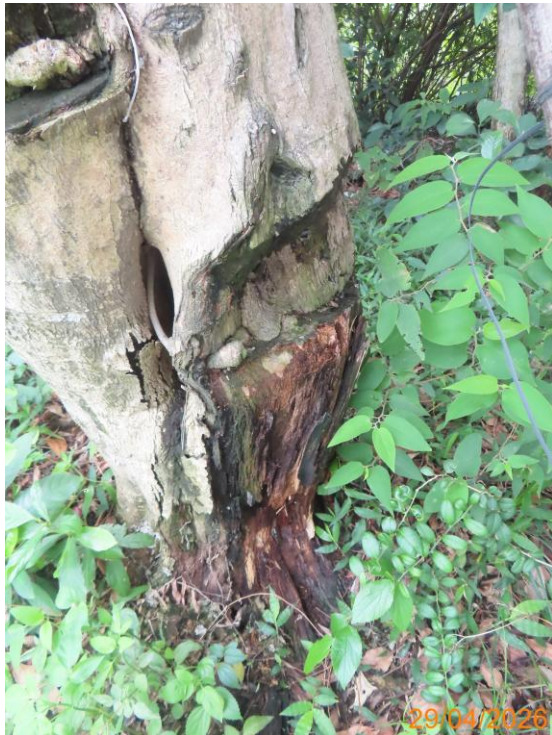
23: U043_Wound on trunk#2