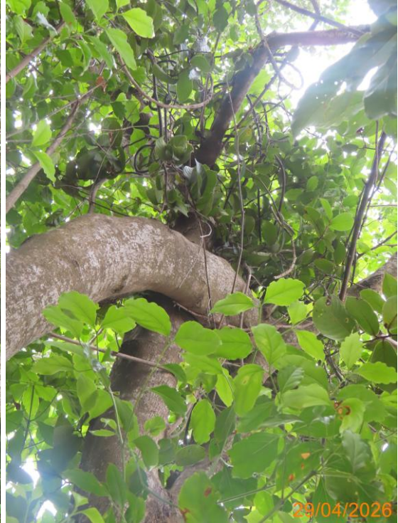
2: T8217_Cross branches