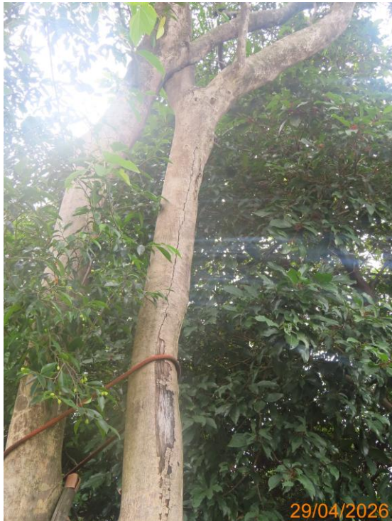
11: U041_Abnormal bark crack on trunk