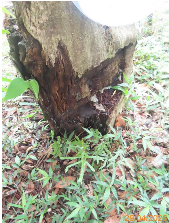
24: U043_Wound on trunk#3