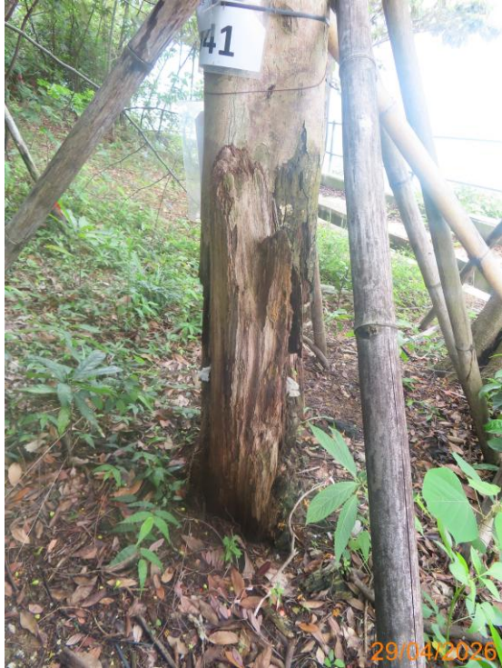
13: U041_Dead stump