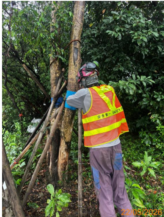
24: Adjust protection pad for U041