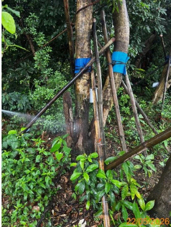
25: Application of fungicide for U041