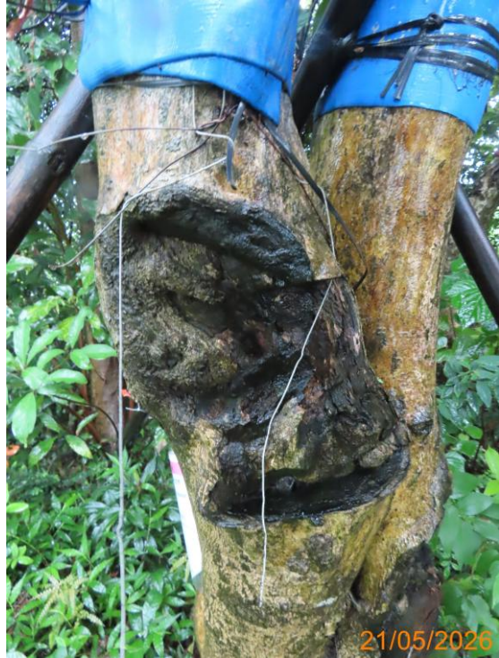
22: U043_Wound on trunk#1