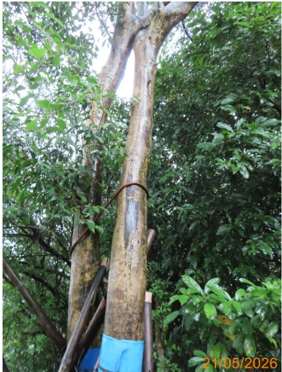
12: U041_Abnormal bark crack on trunk