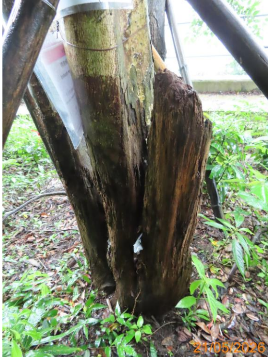
17: U041_Wound damage at trunk union#2