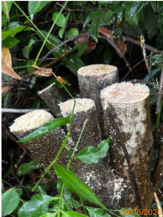
7: T8231_ Pruning of broken epicormics