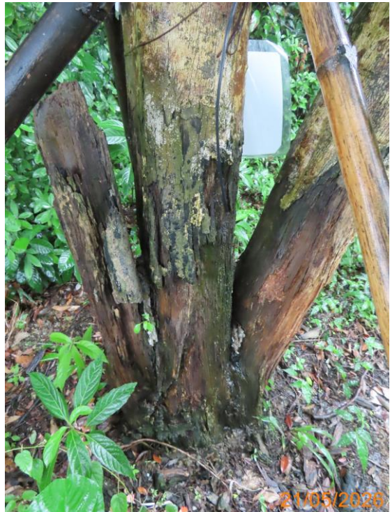
16: U041_Wound damage at trunk union#1