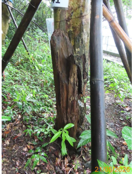
14: U041_Dead stump