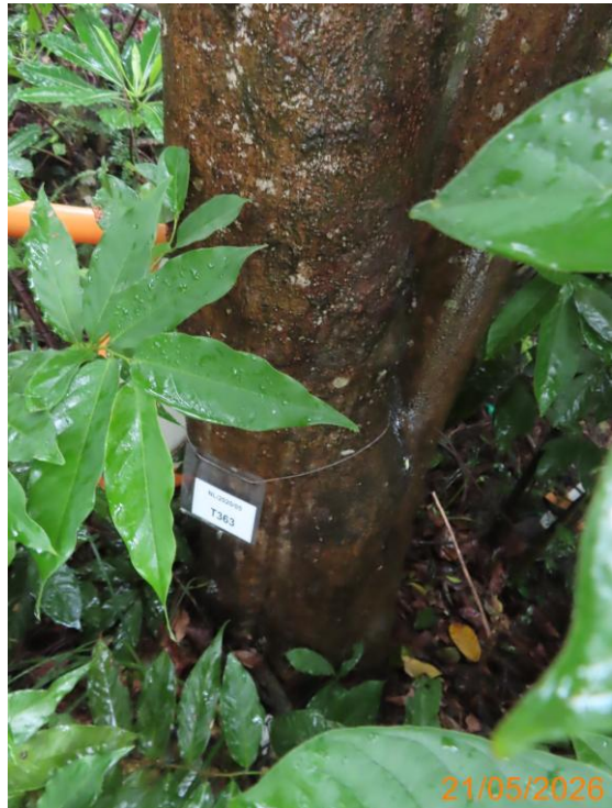
4: T8217_Trunk base