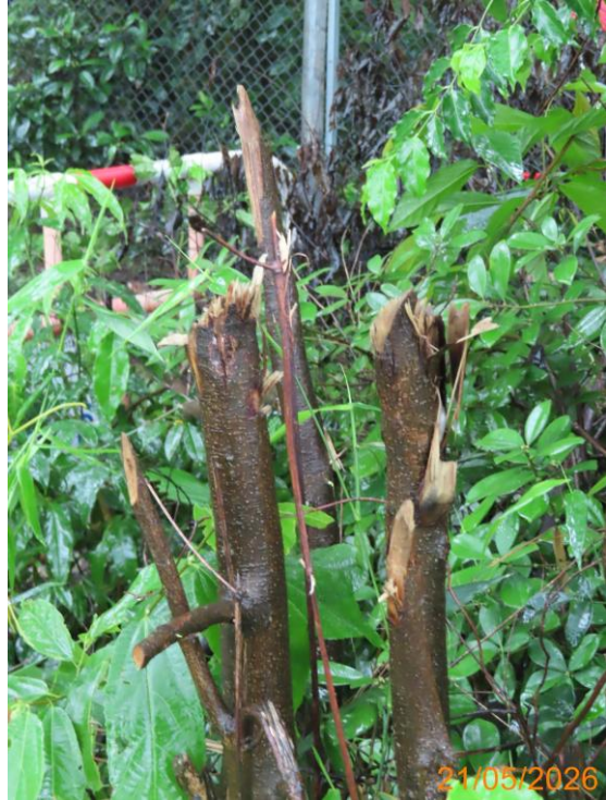
6: T8231_Broken epicormics