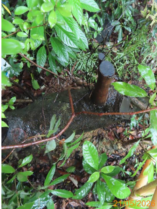
9: T8231_Trunk base