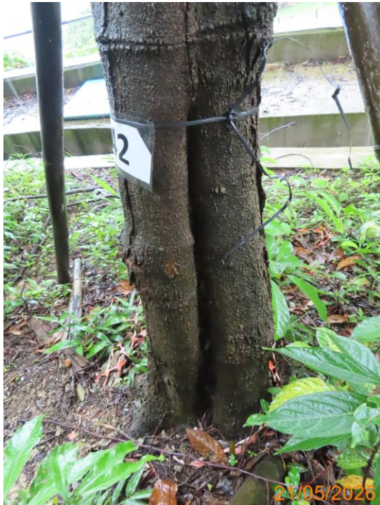
19: U042_Wound on trunk base